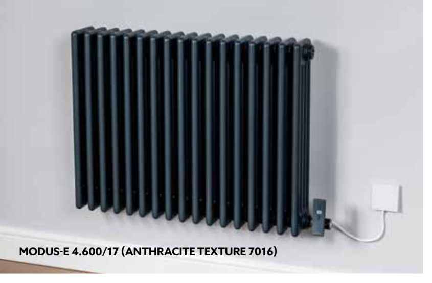
MODUS-E 4.600/17 (ANTHRACITE TEXTURE 7016)

RAL COLOURS/FINISHES Lead Time: 7 working days