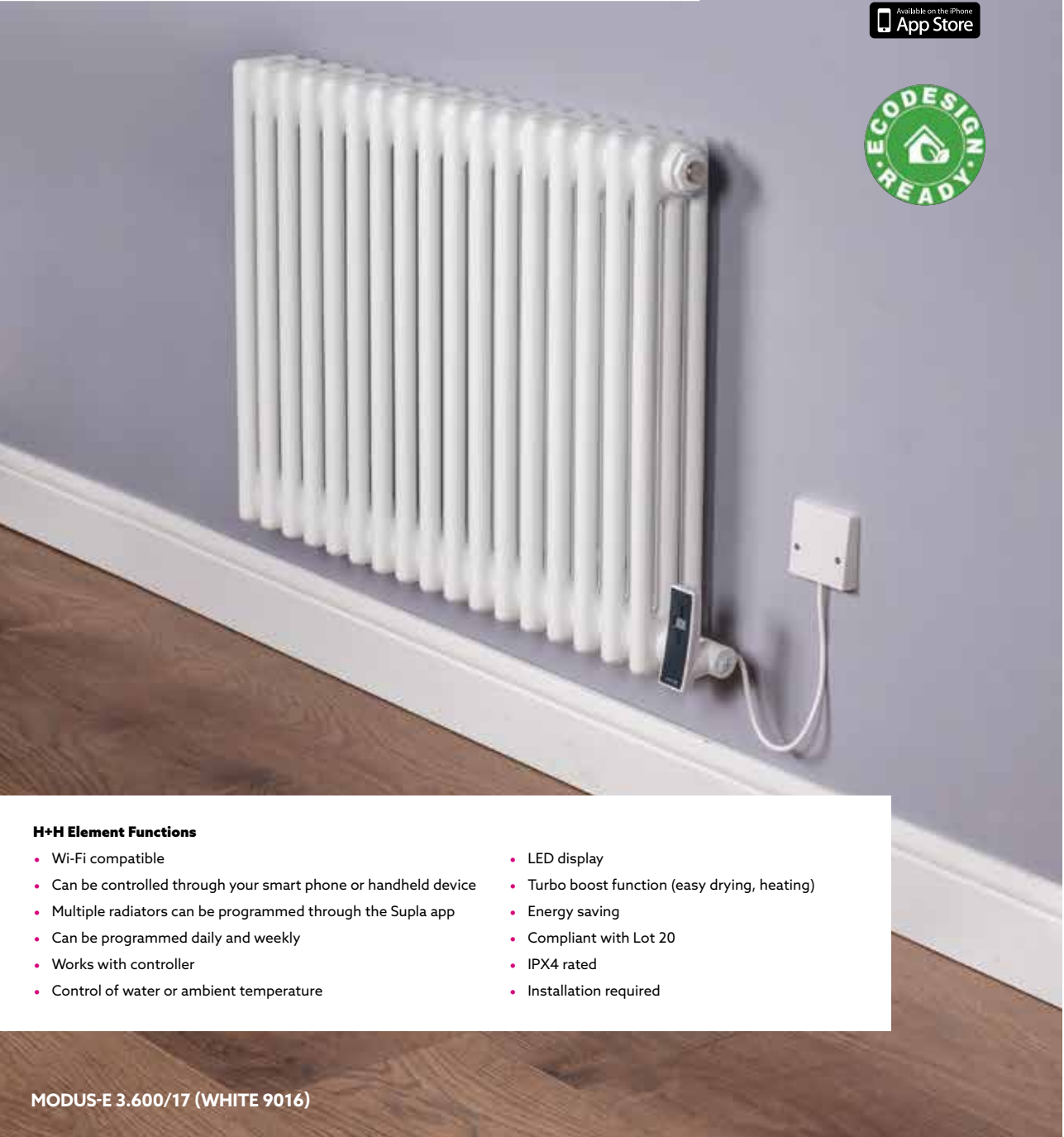
MODUS-E 3.600/17 (WHITE 9016)