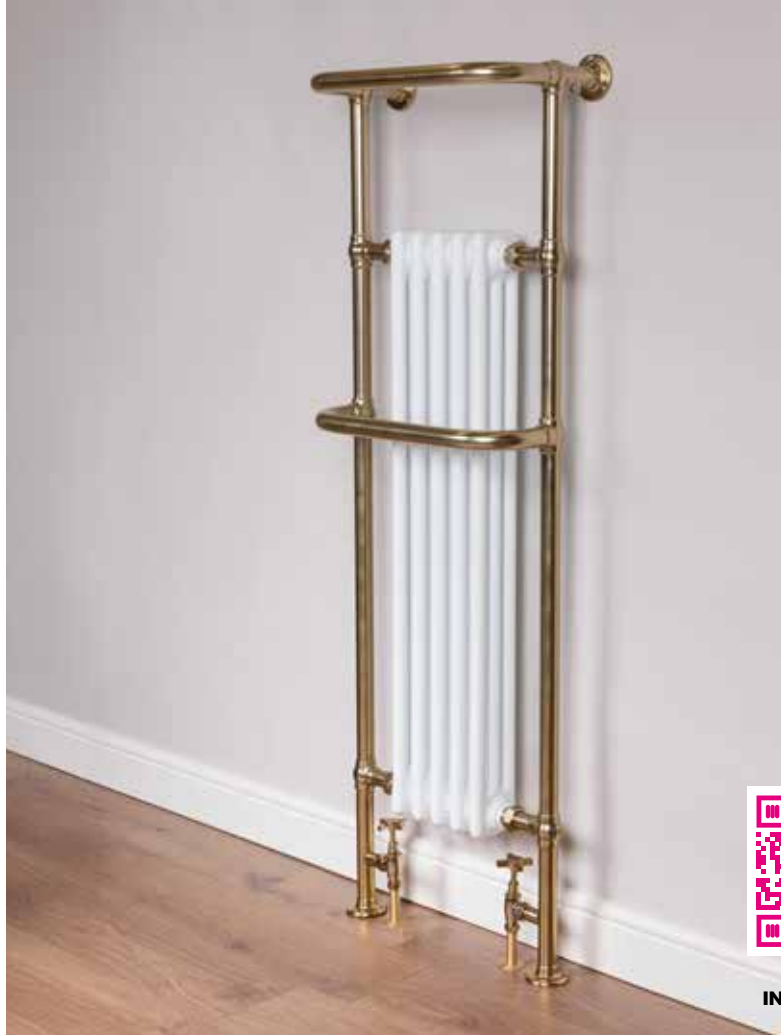
LAMBOURNE (BRUSHED BRASS)