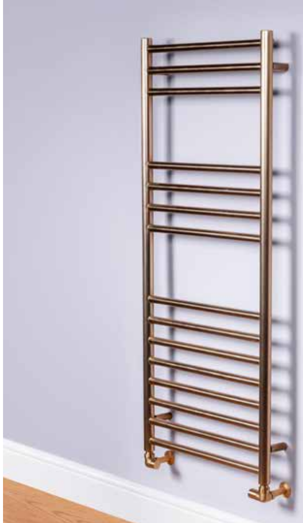
BONHAM 50/120 (BRUSHED BRASS)