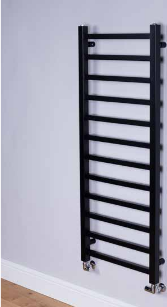
STALIA 50/120 (BLACK MATT 9005)

TECHNICAL INFORMATION Wall to front face = 79-89mm Wall to pipe centres = 60-70mm Standard connections 1/2"