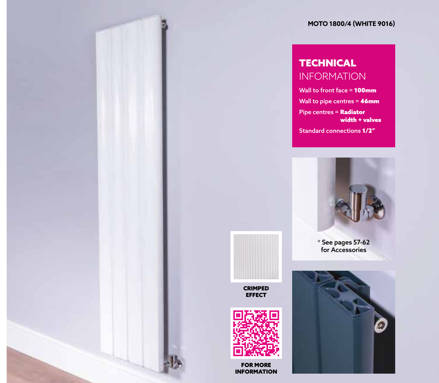
MOTO 1800/4 (WHITE 9016)