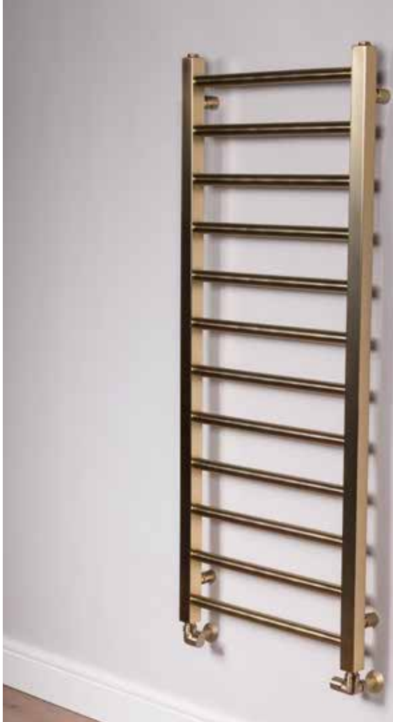
KYLO 50/120 (BRUSHED BRASS)