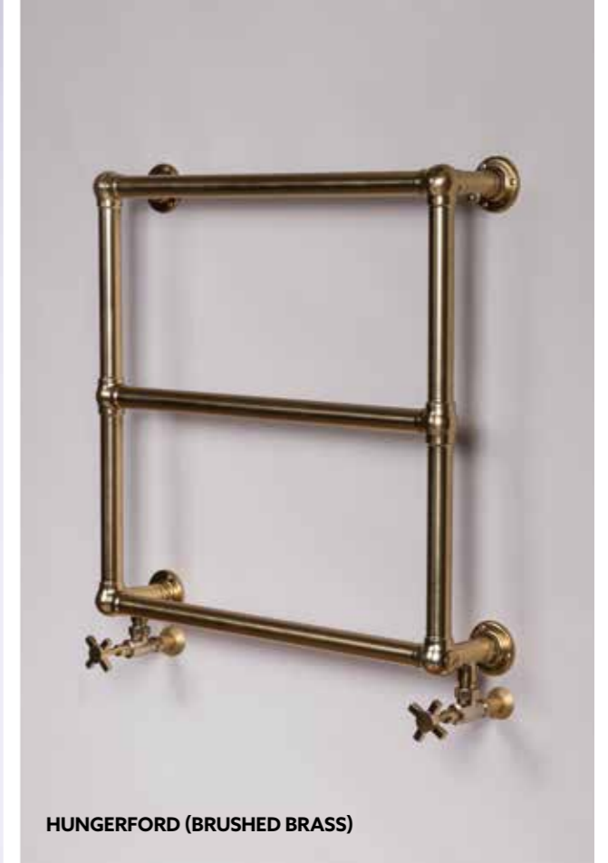
HUNGERFORD (BRUSHED BRASS)