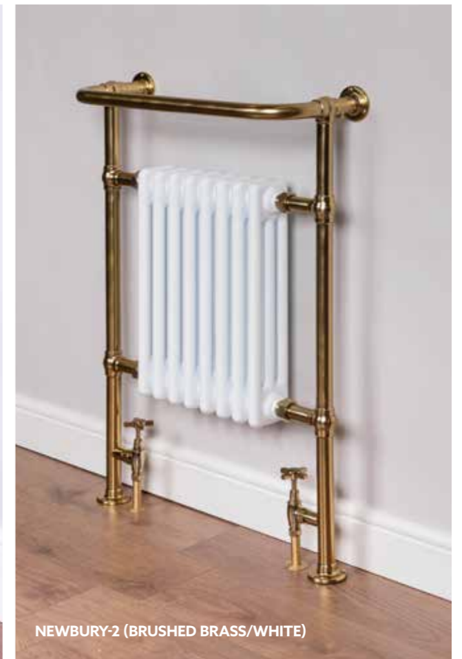
NEWBURY-2 (BRUSHED BRASS/WHITE)