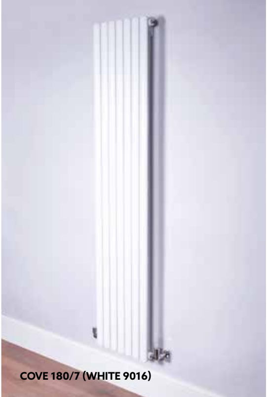
COVE 180/7 (WHITE 9016)

RAL COLOURS/FINISHES (Details page 63) Lead Time: 7-10 working days