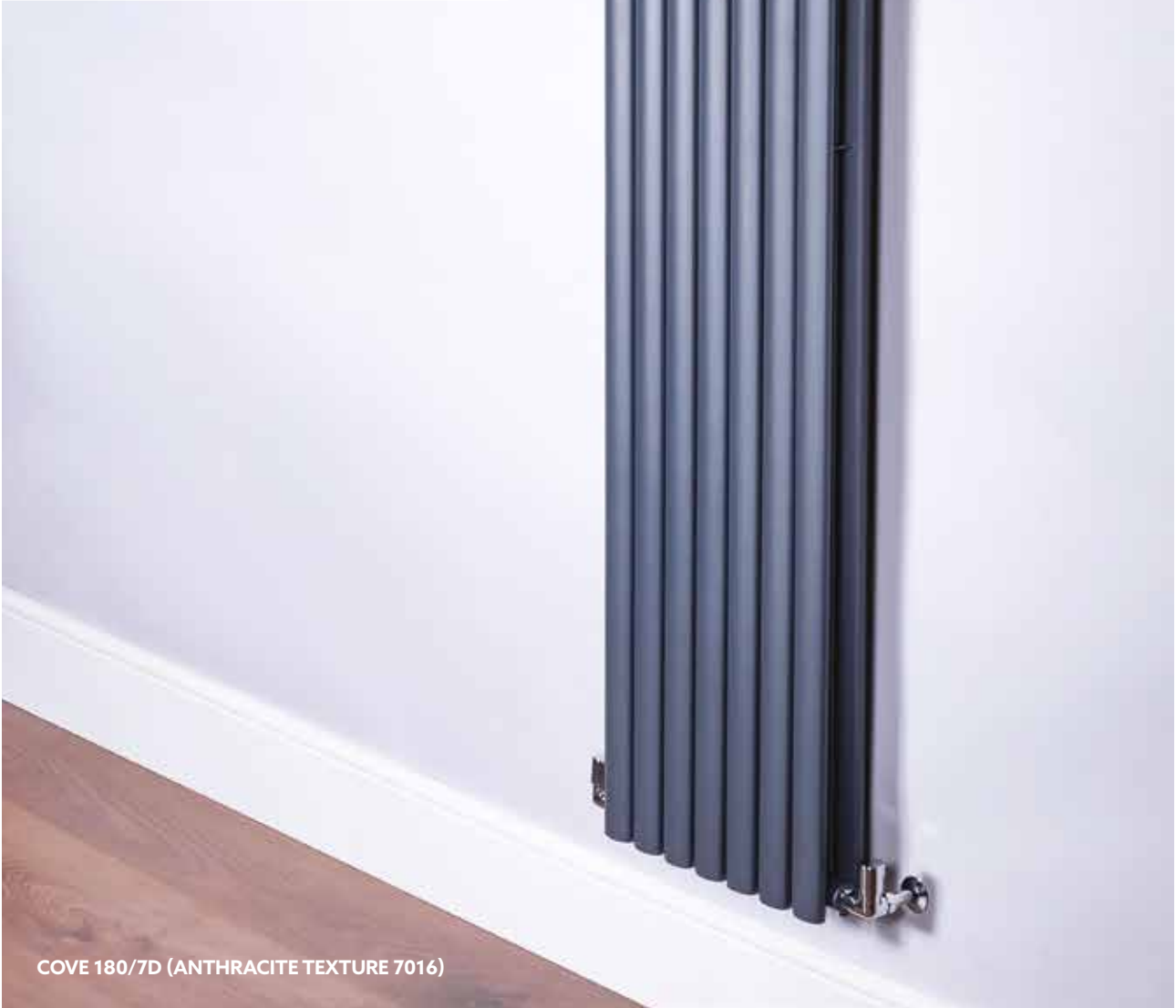
COVE 180/7D (ANTHRACITE TEXTURE 7016)