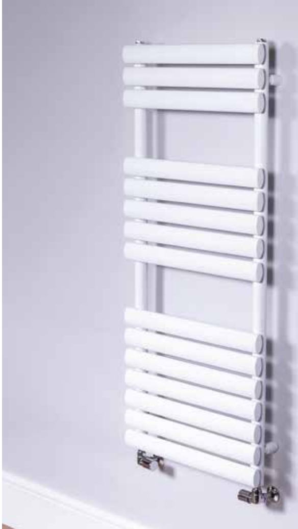
COVE TR50/120 (WHITE 9016)