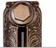
MAIN IMAGE: Shown in Polished Matt Lacquered Gold INSET IMAGE: Shown in Polished Matt Lacquered Bare Metal