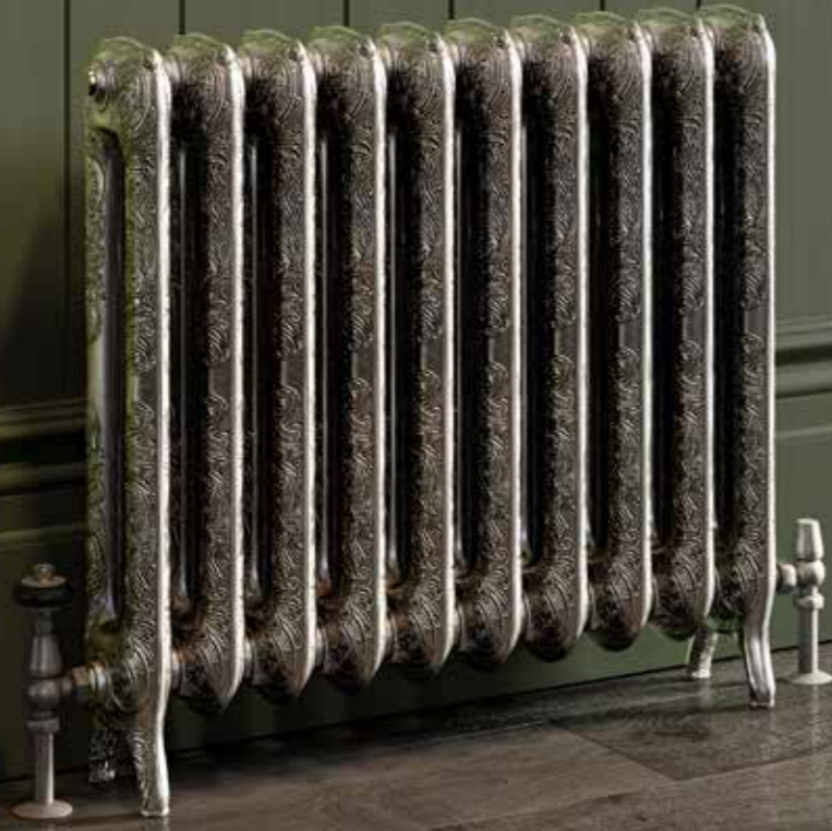
MAIN IMAGE: Shown in Polished Lacquered Bare Metal INSET IMAGE: Shown in Polished Matt Lacquered Bronze