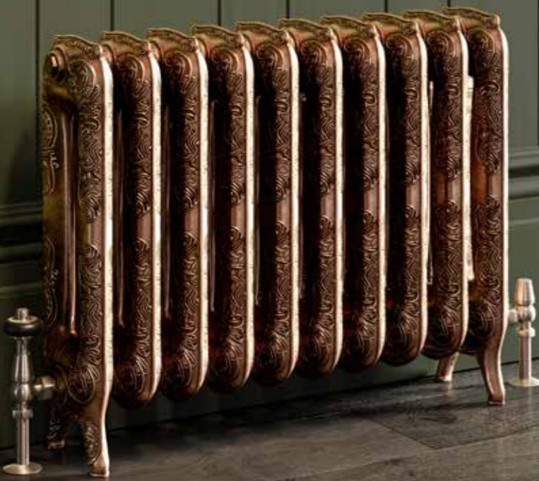
MAIN IMAGE: Shown in Polished Lacquered Bronze INSET IMAGE: Shown in Polished Lacquered Gold