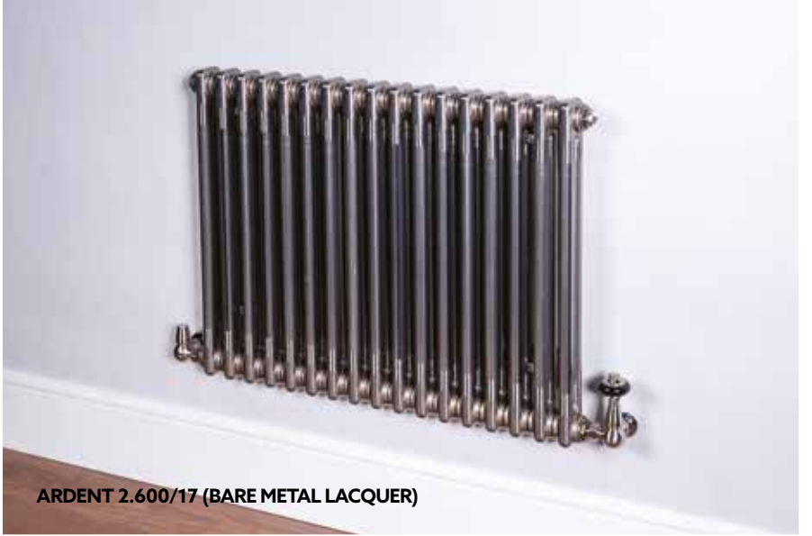
ARDENT 2.600/17 (BARE METAL LACQUER)

RAL COLOURS/FINISHES (Details page 63) Lead Time: 7-10 working days