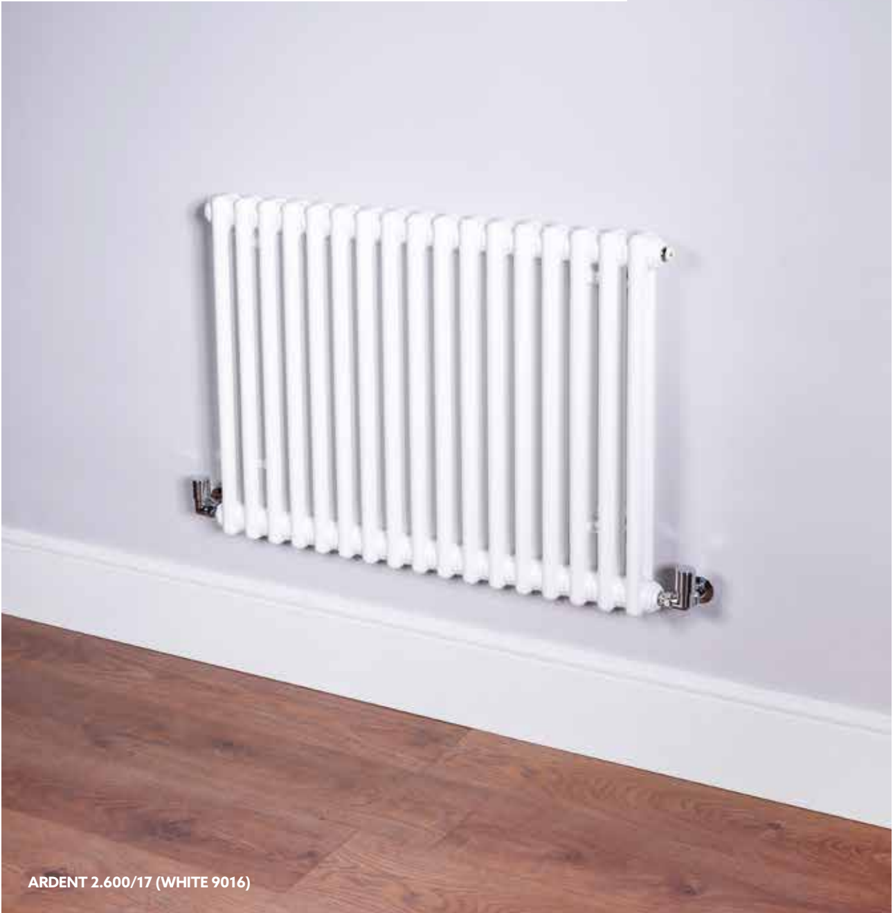
ARDENT 2.600/17 (WHITE 9016)