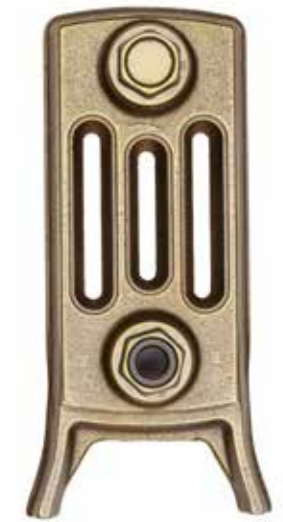
Polished Matt Lacquered Gold