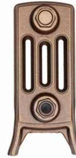
Polished Matt Lacquered Bronze