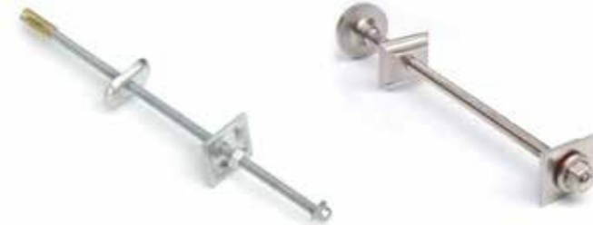
Standard wall stay