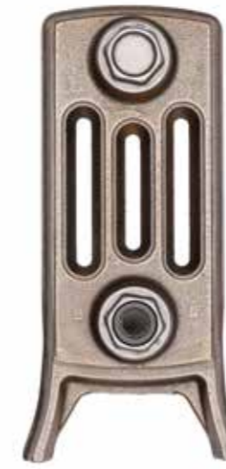
Polished Matt Lacquered Bare Metal