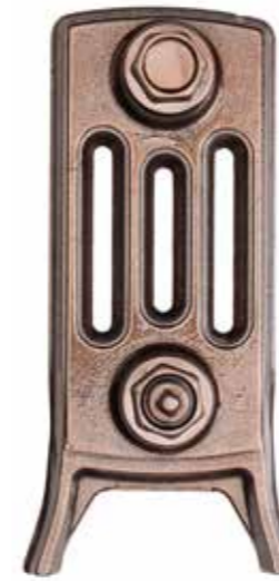
Polished Lacquered Bronze