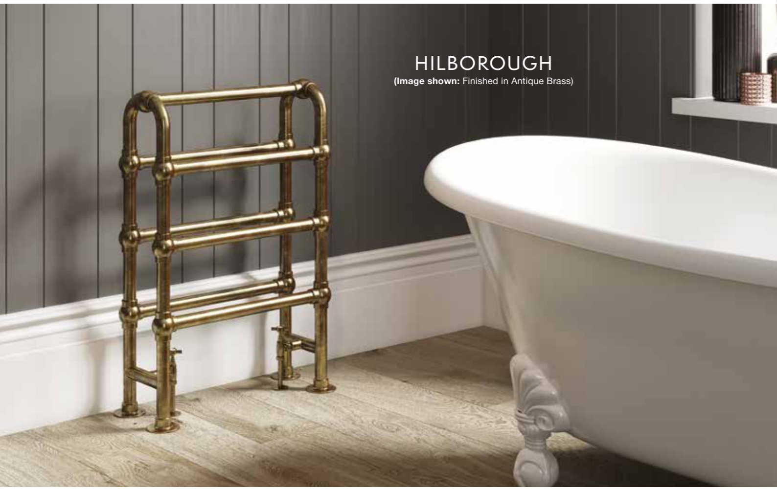
HILBOROUGH (Image shown: Finished in Antique Brass)

MATERIAL Brass (Mild Steel radiator inserts)