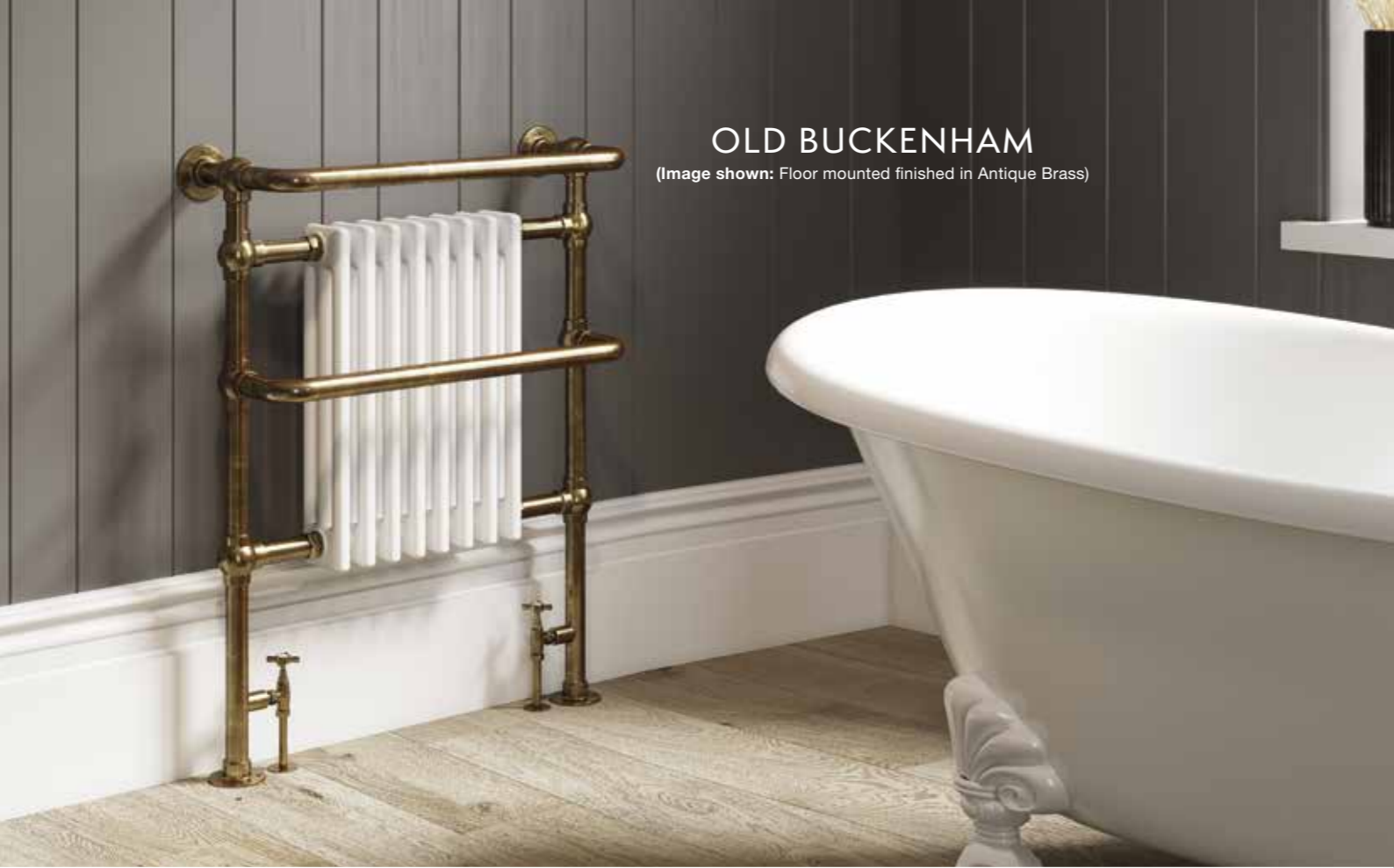
OLD BUCKENHAM (Image shown: Floor mounted finished in Antique Brass)