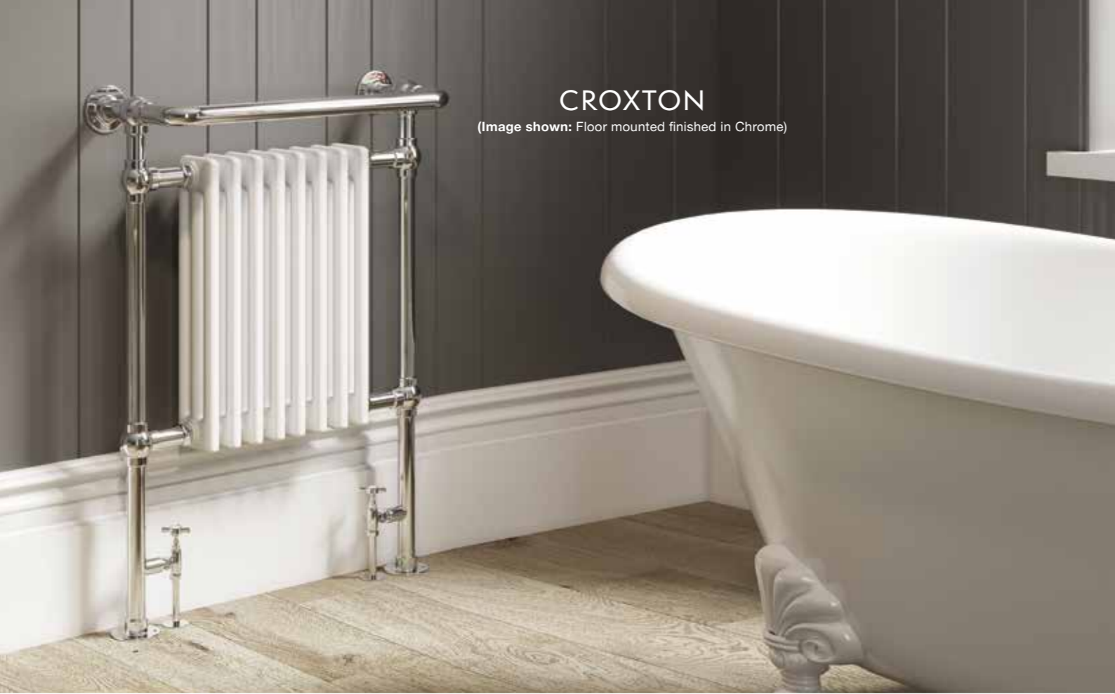
CROXTON (Image shown: Floor mounted finished in Chrome)