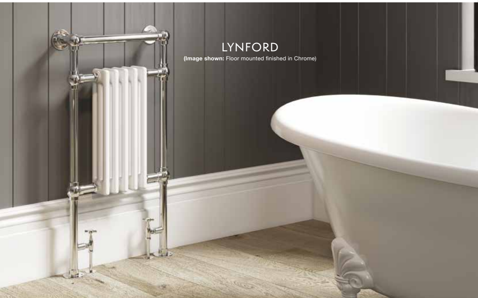
LYNFORD (Image shown: Floor mounted finished in Chrome)

MATERIAL Brass (Mild Steel radiator inserts)