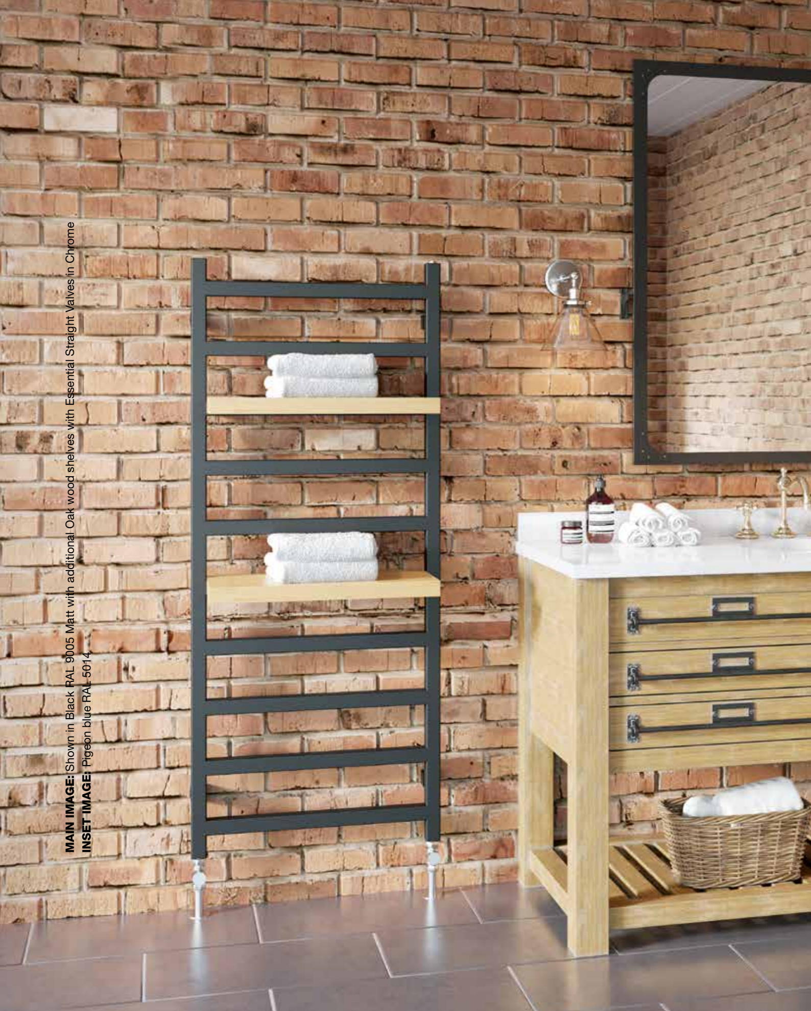
MAIN IMAGE: Shown in Black RAL 9005 Matt with additional Oak wood shelves with Essential Straight Valves in Chrome INSET IMAGE: Pigeon blue RAL 5014