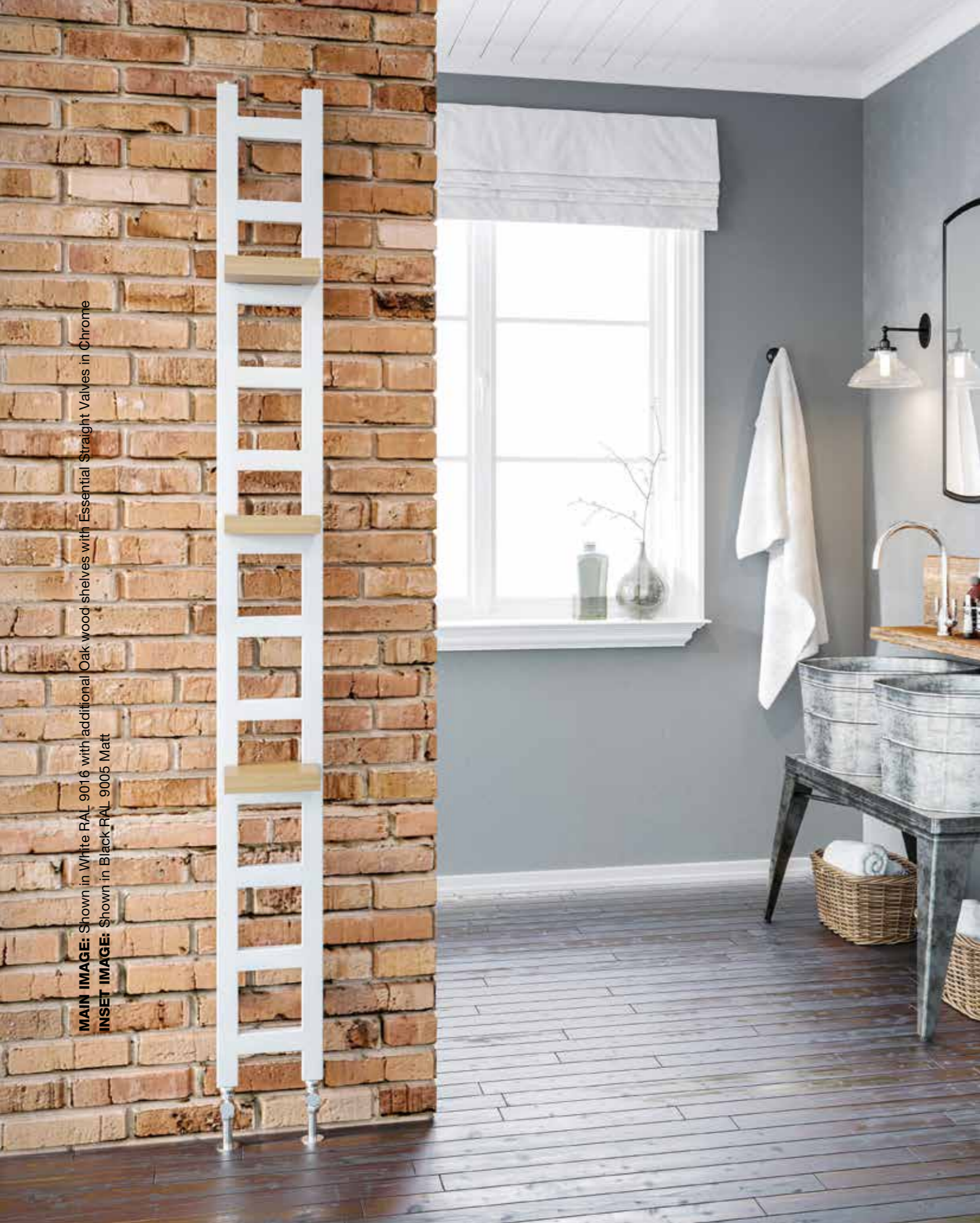
MAIN IMAGE: Shown in White RAL 9016 with additional Oak wood shelves with Essential Straight Valves in Chrome INSET IMAGE: Shown in Black RAL 9005 Matt