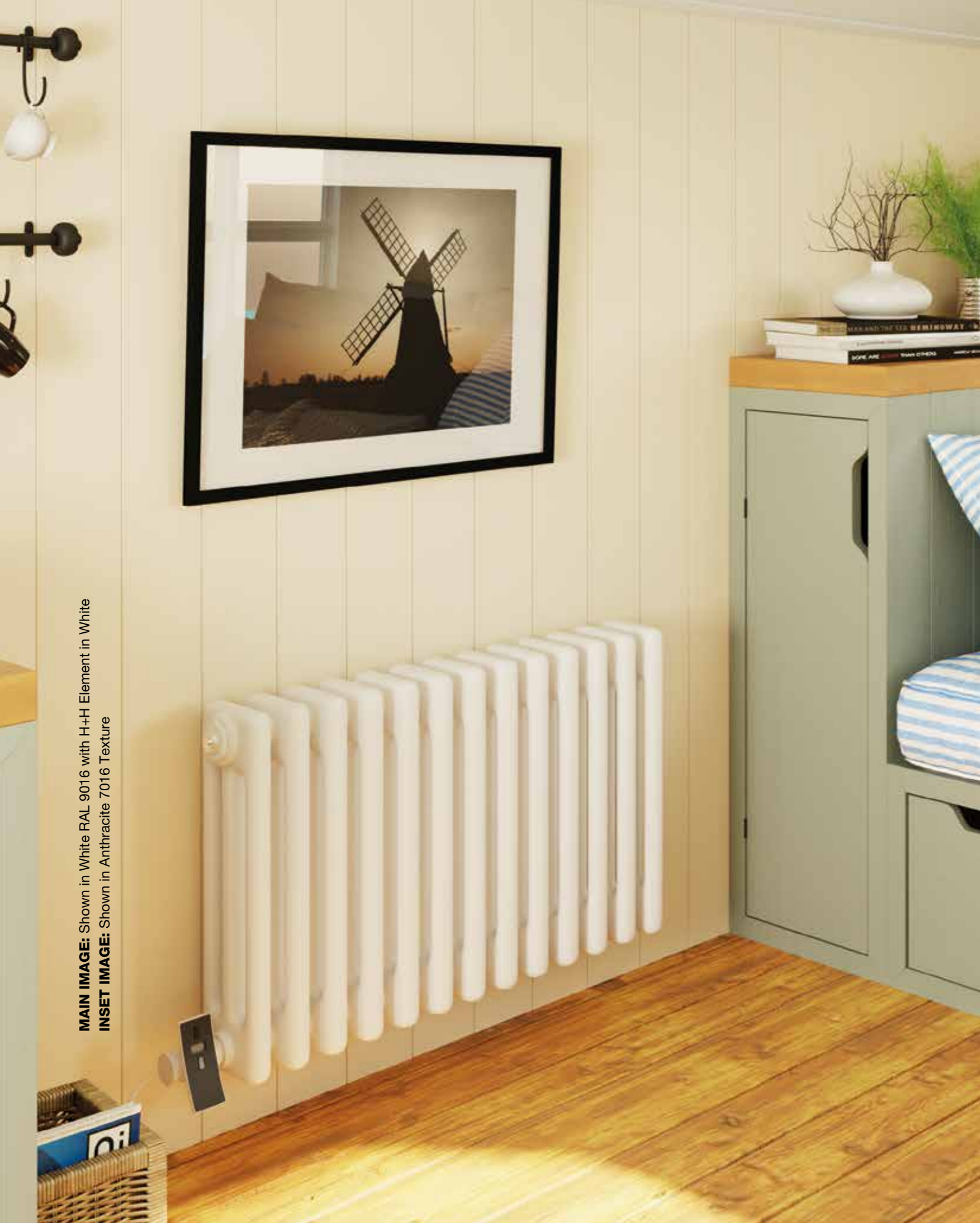
MAIN IMAGE: Shown in White RAL 9016 with H+H Element in White INSET IMAGE: Shown in Anthracite 7016 Texture