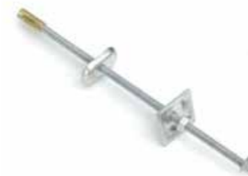
Standard wall stay