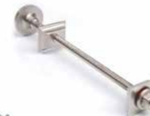
Luxury wall stay