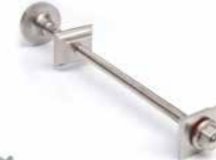
Luxury wall stay