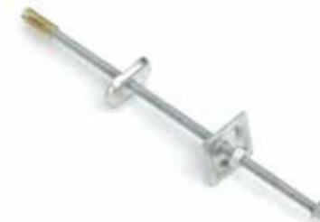
Standard wall stay