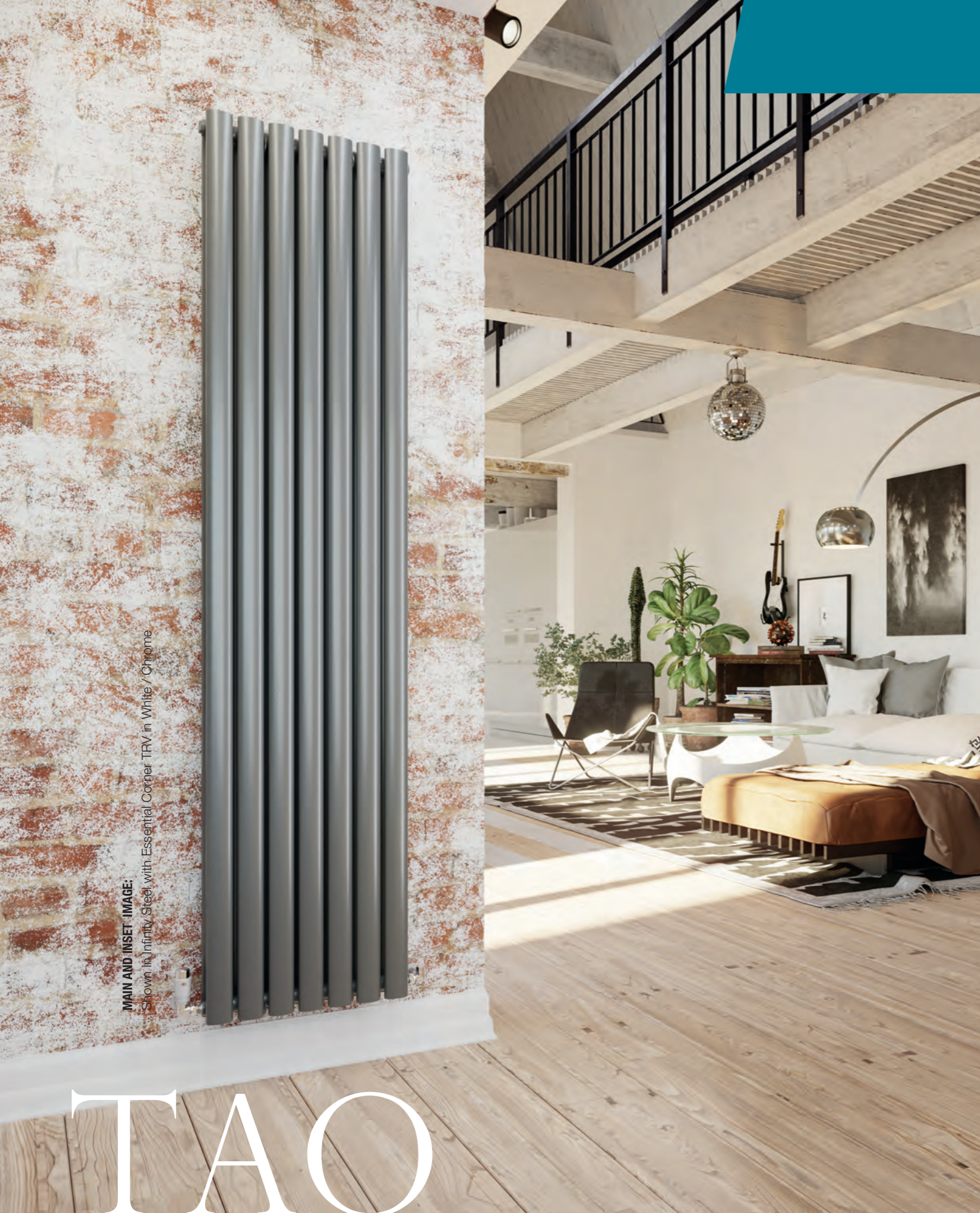
MAIN AND INSET IMAGE: Shown in Infinity Steel with Essential Corner TRV in White / Chrome