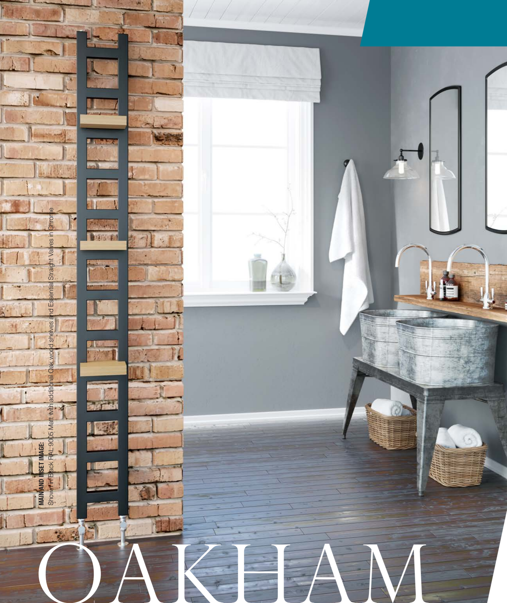
MAIN AND INSET IMAGE: Show in Black RAL-9005 Matt with additional Oak wood shelves and Essential Straight Valves in Chrome