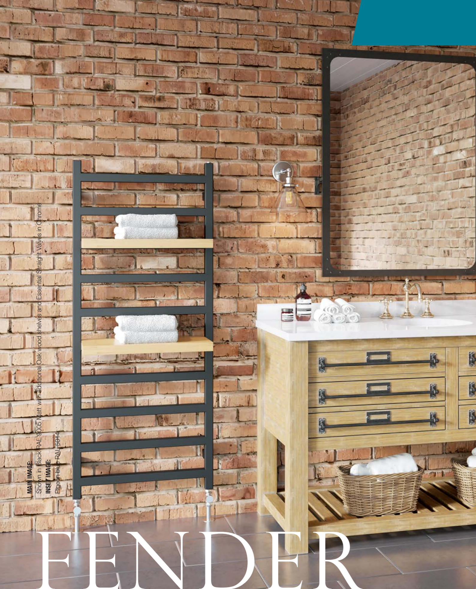
MAIN IMAGE: Shown in Black RAL 9005 Matt with additional Oak wood shelves and Essential Straight Valves in Chrome INSET IMAGE: Pigeon-blue RAL 5014